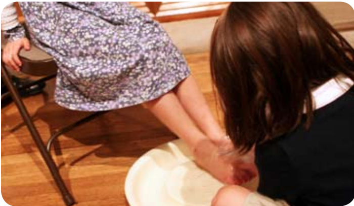
During Calvary's Maundy Thursday service, individuals and families of all ages participated in the footwashing.