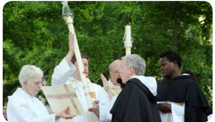
Calvary's Easter Vigil service began in the east parking lot with our sisters and brothers from St. Peter Catholic Church.