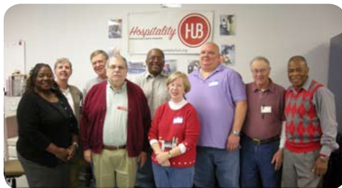
Volunteers play a crucial role in the day-to-day operations of the Hospitality HUB. With only two full-time and two part-time staff members, the majority of our services are made available through dedicated and talented volunteers.